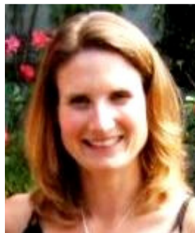
Regent and planning